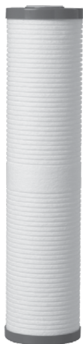
AP810-2 / AP811-2