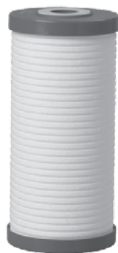
AP810 / AP811